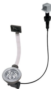
LIRA automatic waste fitting 8407 103