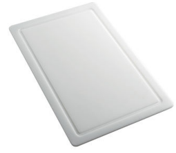
HDPE Chopping board 8657 001