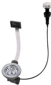
Automatic waste fitting 8407 000