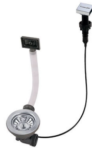
LIRA automatic waste fitting 8407 102