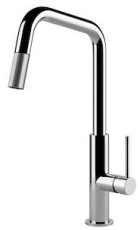
Mixer Tap KS Plus 8522 000